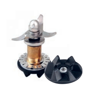
Cutter Assembly for HBB250-CE / HBB250S-CE # 9181498 Clutch for RIO HBB250 / HBB250S # 9181488