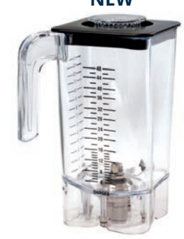
Polycarbonat Container for HBH750-CE, stackable Eclipse Blender complete | 1,4L