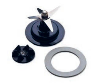
Repair Kit for HBB908R-CE # 98908R