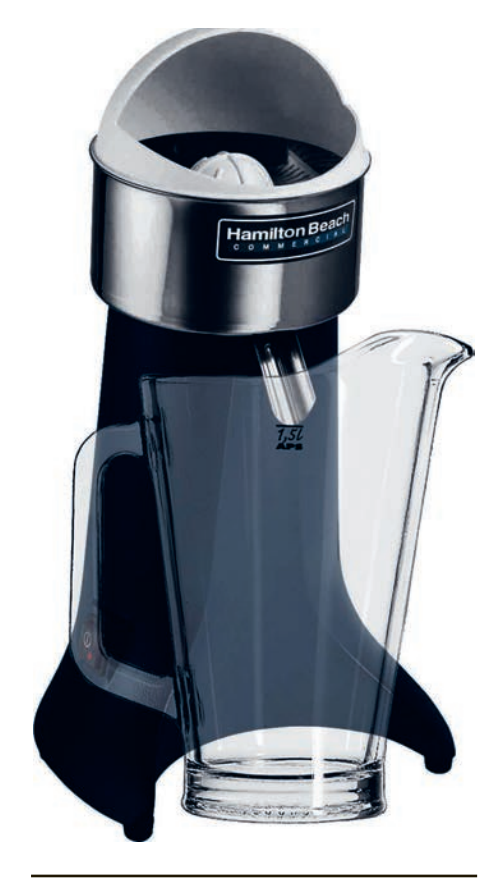
Electric Citrus Juicer # HCJ967-CE (1G96700)