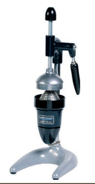
Manual Citrus Juicer commercial citrus juicer # 16932