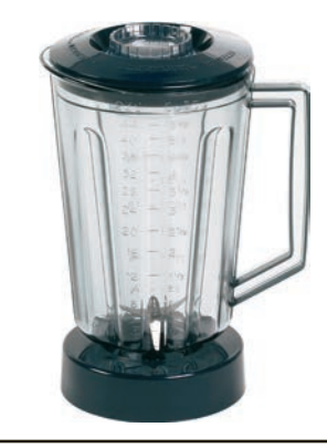
Polycarbonat Container for HBB918/HBB919 complete | 1,3L # 6126-918