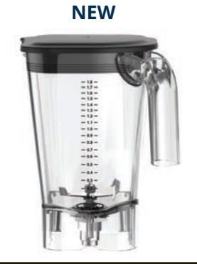
Polycarbonat Container for HBH755-CE, stackable Eclipse Blender complete | 2,0L