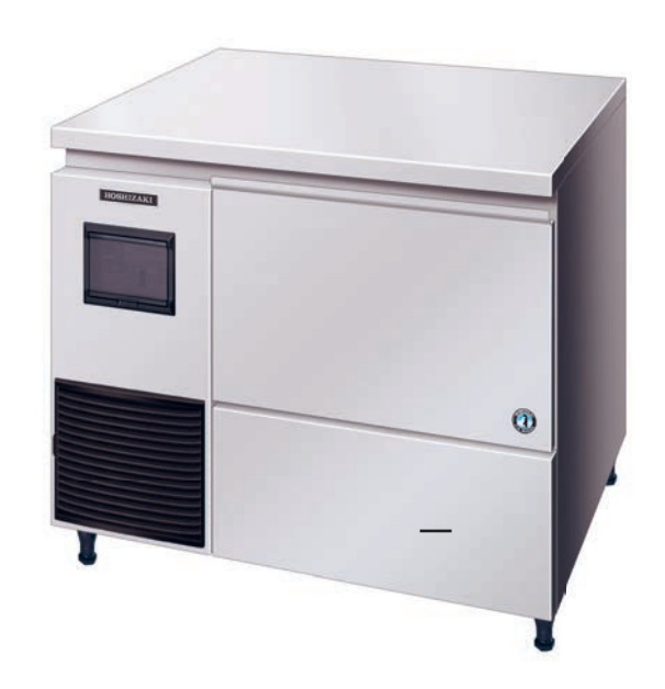
Nugget-Ice Maker 140kg/day | 57kg bin | Self-contained type # FM-120KE-50-HCN

For more information, please contact our service staff.