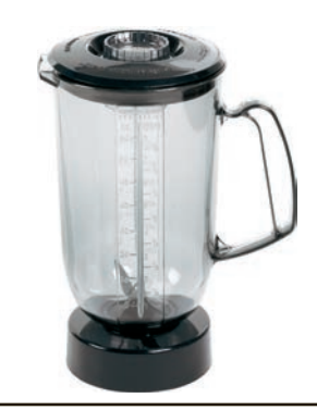
Polycarbonat Container for 1G912 complete | 2L # 6126-912