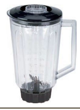
Polycarbonat Container for HBB908/HBB909 complete | 1,3L # 6126-HBB908-CE