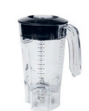
Polycarbonat Container for HBB450-CE complete | 1,42L # 6126-450-CE