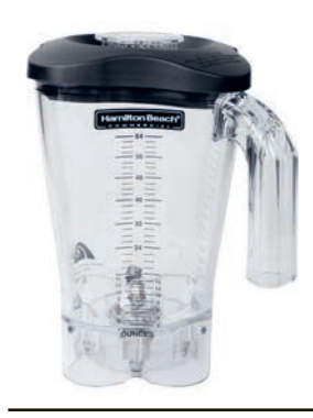
Polycarbonat Container for Tempest, Summit and Revolution Blender complete 1,89L