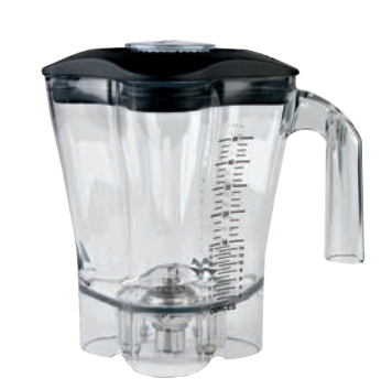
Polycarbonat Container for Tempest, Summit and Revolution Blender complete 1,4L