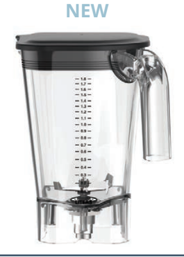
Polycarbonat Container for HBH755-CE, stackable Eclipse Blender complete | 2,0L # 6126-755-CE