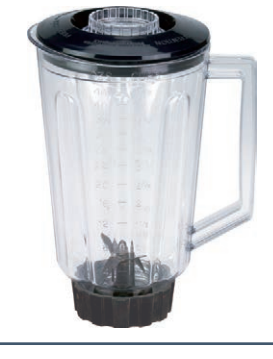
Polycarbonat Container for HBB908/HBB909 complete | 1,3L