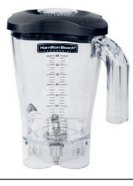
Polycarbonat Container for Tempest, Summit and Revolution Blender complete 1,89L