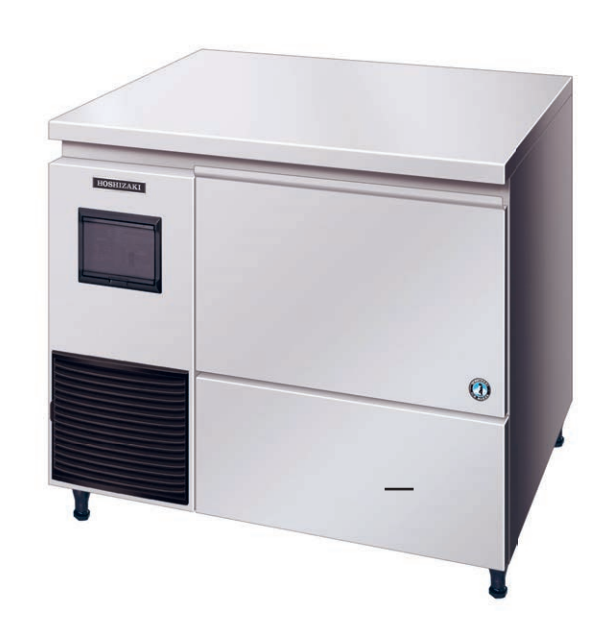
Nugget-Ice Maker 140kg/day | 57kg bin | Self-contained type # FM-120KE-50-HCN

For more information, please contact our service staff.