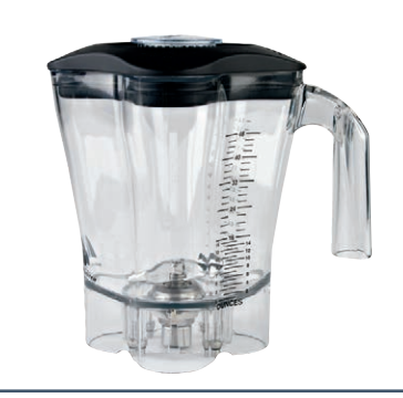
Polycarbonat Container for Tempest, Summit and Revolution Blender complete 1,4L