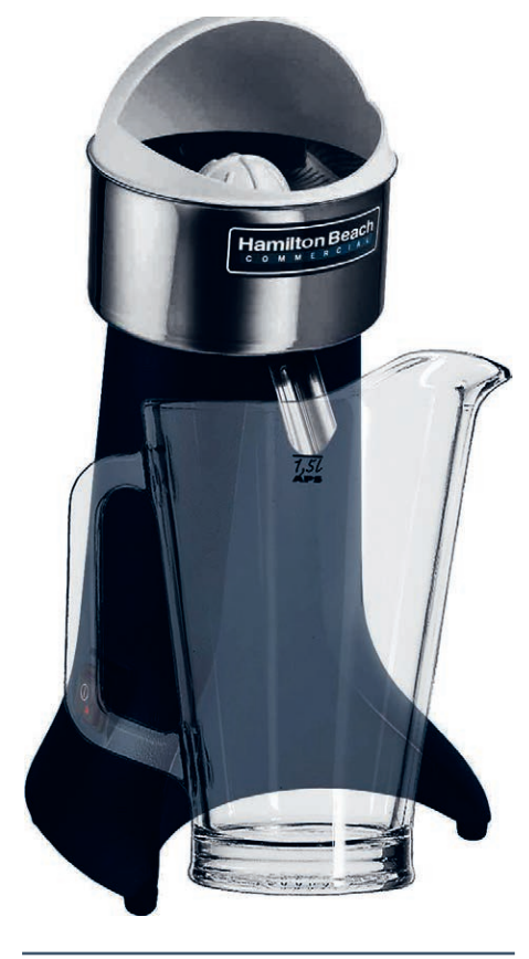
Electric Citrus Juicer # HCJ967-CE (1G96700)