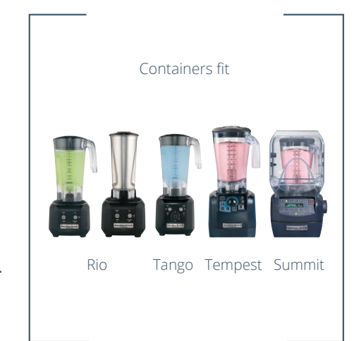
Cover for HBB250S # 9181491