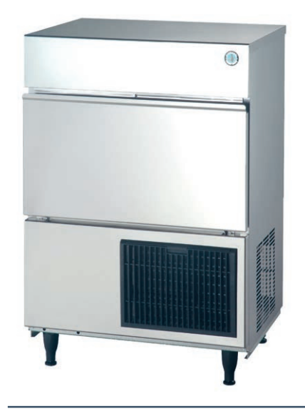
Ball-Ice Maker 26kg/day (app.530 balls) | Self-contained type # IM-65NE-HC / -Q / -LM103